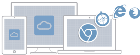
Flexible, Cross-Platform Client Support

Powered by Kerio Connect which is a best-in-class secure messaging platform for businesses and organizations that prefer a simple approach to IT.