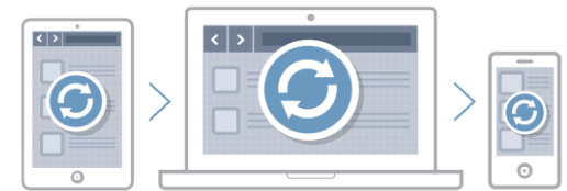
BYOD Made Easy